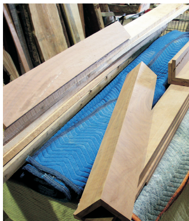
Photo.3: The job required 1200mm long lengths of Forest Red Gum mitre cut to form angle section frames

In any case we needed a new blade for our Wadkin Panelmaster so we contacted Promac and organised delivery of a U Blade of the required size.